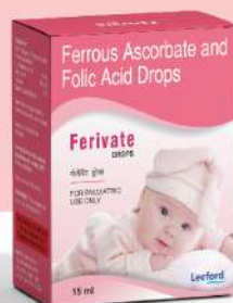
Pack : 15 ml Drops