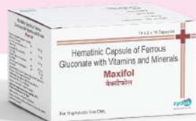
Pack : 10 x 2 x 15 Capsules