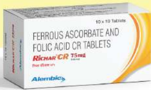
Pack : 10 x 10 Tablets