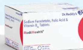
Pack : 10 x 15 Tablets