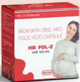
Pack : 10 x 2 x 15 Capsules