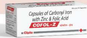
Pack : 10 x 3 x 15 Tablets