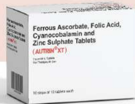
Pack : 10 x 10 Tablets